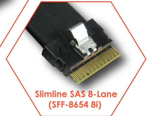
Slimline SAS 8-Lane (SFF-8654 8i)