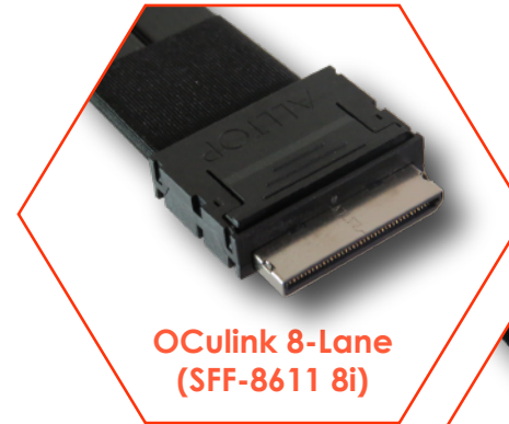
Oculink 8-Lane (SFF-8611 8i)